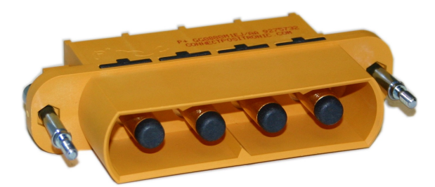
Front view of the adapter included with the AK9 kit. This end may be plugged directly into the rear panel output connector, or into the output end of the AV-HLZ1-100 cable.