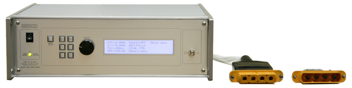
Pulser mainframe (left) with AK9 kit, including the AV-HLZ1-100 output cable (middle) and mating adapter (right)