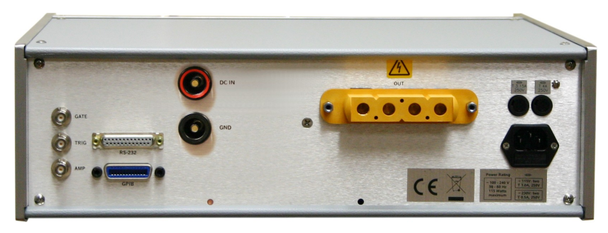
AV-109F Series Rear Panel. (AV-109E models do not have the DC and GND power supply terminals).