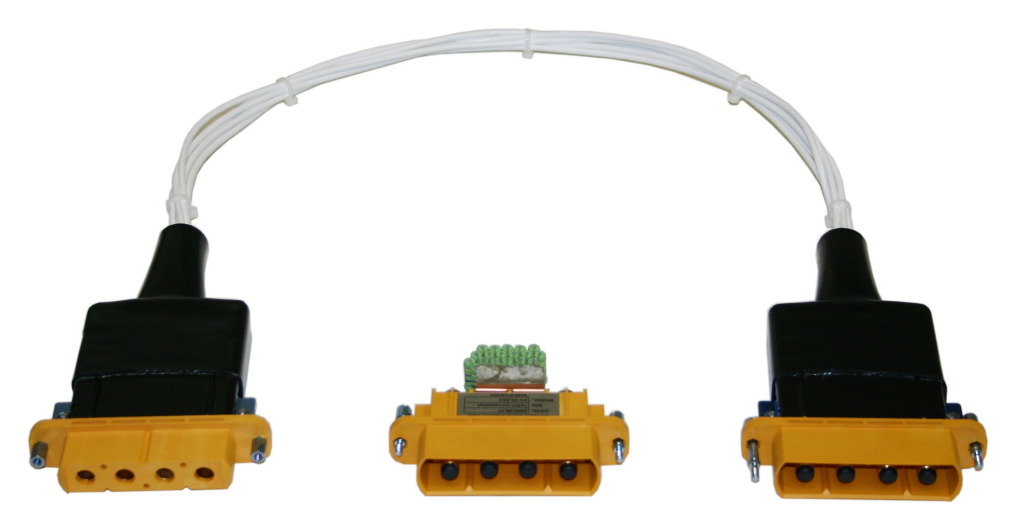
AK9 kit, including the AV-HLZ1-100 output cable (right and left) and mating adapter (middle). The adapter is shownwith some test resistors installed on copper brackets. The copper brackets are screwed into the four contact posts on the rear of the adapter. These brackets and resistors are not included with the adapter; this is just a sample configuration.