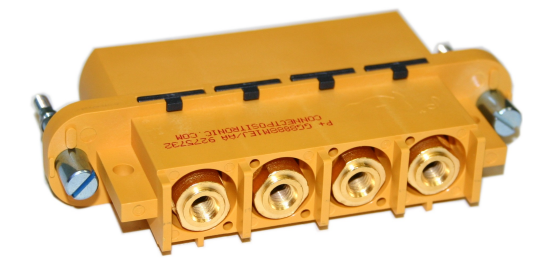
Rear view of the adapter included with the AK9 kit. The outer two contact posts are grounded, and the inner two carry the signal. The user may screw into these posts, to attach the user's load.